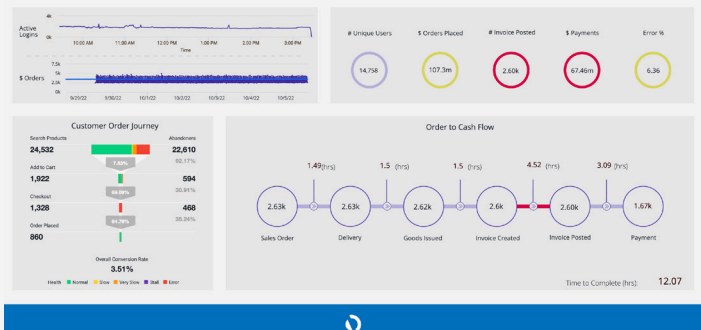
Order Management Dashboard